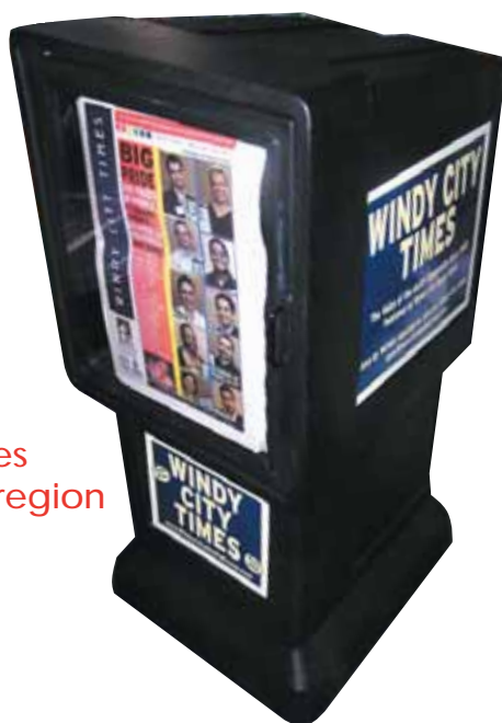
Distribution Boxes throughout the region