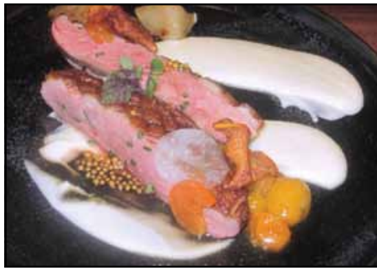
Duck (left) and the Southside Mule at Baptiste & Bottle.

Cocktails are seasonal and, indeed, tasty. Items include the Southside Mule (koyal "baptiste series" bourbon, pineapple-rosemary shrub and ginger) served in a nifty copper cup; a Rootbeer Fizz that's a step up from the A&W you enjoyed as a kid; and a $20 science experiment called a Curtsy & Bow that incorporates bourbon, orgeat, absinthe—and what's called a "Tonka fog."